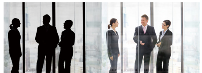
Without WDR Pro