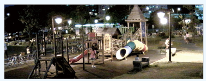
VIVOTEK SNV Camera - Show you true colors at night