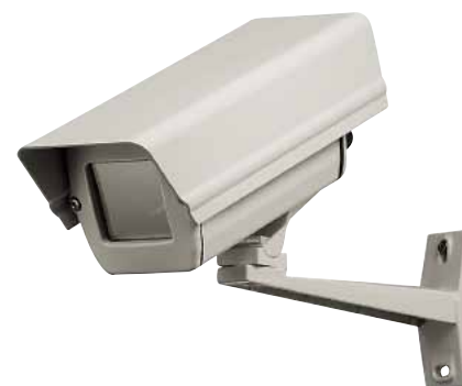
HET + WBCAA

A wide range of accessories is available: sunshield, heater kit and camera power supply in weatherproof box.