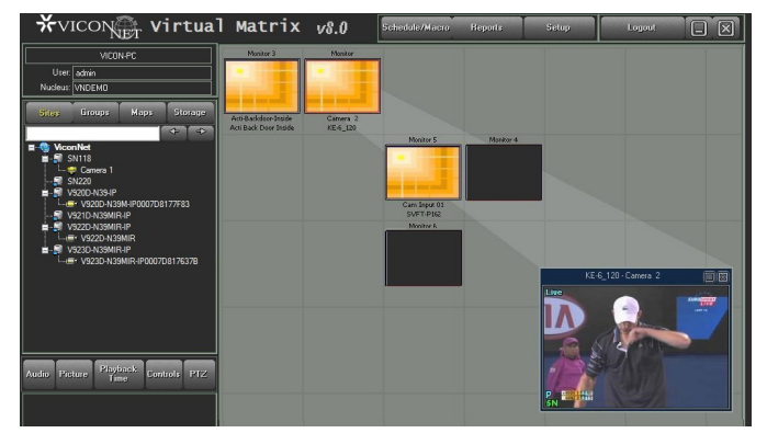
VM Display Controller Main Monitor Display

The Main Monitor display interface allows dynamic control of the layout and content is easily added by dragging and dropping cameras into the monitor views. Multilevel map displays can be used to provide an alternative means of identifying camera locations and graphically depicting alarms.