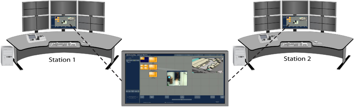
Main Monitor Display

A multiple station installation employing 2 VMDC Tower units is shown above. Station 2 can be at a remote location or another facility. ViconNet video is provided to each station via the network. Each operator has access to the Main Monitor Display and can view and control monitors on the Monitor Wall, if so equipped, or any system monitor. Typically, most operators would view local ViconNet video at their stations and one operator would control the VMDC.