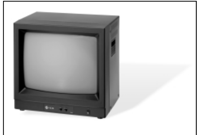
VM520 MONOCHROME MONITOR