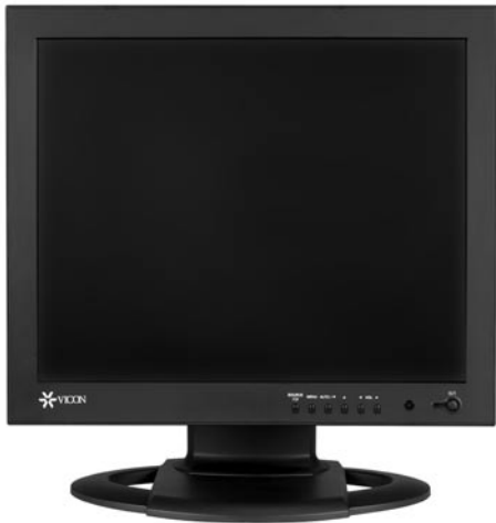
VM-717LCD-1 and VM-719LCD-1