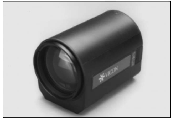
V8-80M-HS-1 MOTORIZED ZOOM LENS