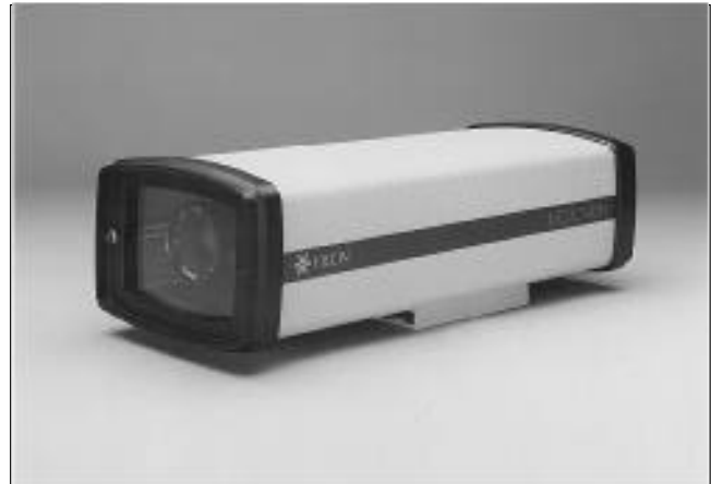
V4.5H ENVIRONMENTAL HOUSING

Available in 12-inch (30 cm) and 15-inch (38 cm) lengths, the V4.5H features flexibility and easy installation. The bolt-hole pattern on the unit's base allows attachment to a variety of remote positioning devices and wall mounts. (The V1600WM Wall Mount with V1600AH Adjustable Head is recommended for fixed mounting.) End caps are simply detached by removing two screws. Because the camera mounting plate is secured to the rear end cap, access to the camera and lens is instant and unhampered. A slot in the mounting plate enables adjustable front-to-back camera positioning. A vent is located on the base of the front end cap, thereby allowing for circulation while keeping out the elements. See Figure 1 for dimensions.