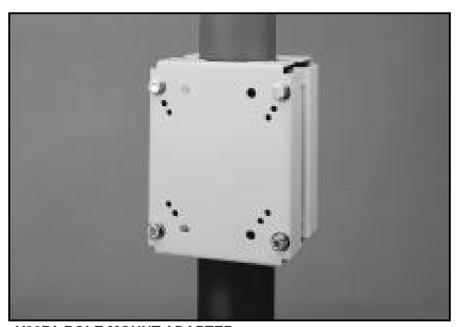
V22PA POLE MOUNT ADAPTER