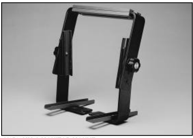
V1512MM-A MONITOR MOUNT

NOTES SPEC NO. REV. SEC. SUPERSEDES PRODUCT SPECIFICATION 610-189 610 599 7