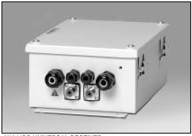
V1311RB UNIVERSAL RECEIVER

NOTES SPEC NO. REV. SEC. SUPERSEDES PRODUCT SPECIFICATION 871-795 871 499 11