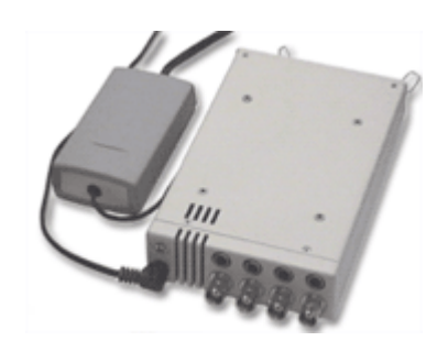
MS-A device AC/DC adaptor Magic Store software