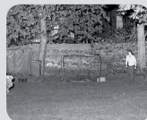
Infra-Red on External