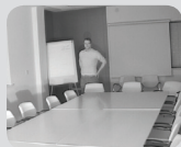
Infra-Red on Internal