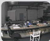
White-Light on Internal