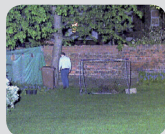
White-Light on External