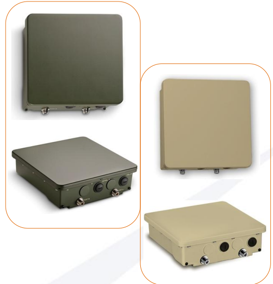
Available in Military Green and Desert Sand colors

Audible tone and real-time signal strength measurement allows quick installation. Pelletier heating and cooling technology inside a ruggedized enclosure enable deployment in extreme weather conditions