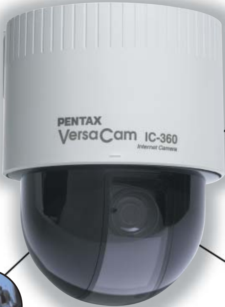
Open the door to security applications.