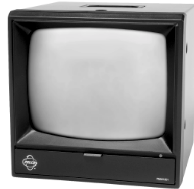
PMM1201 SERIES MONITOR

The PMM901/PMM102/PMM1501 Series provide the optimum solution for a variety of CCTV surveillance applications where clear, high quality pictures and proven system reliability are required.