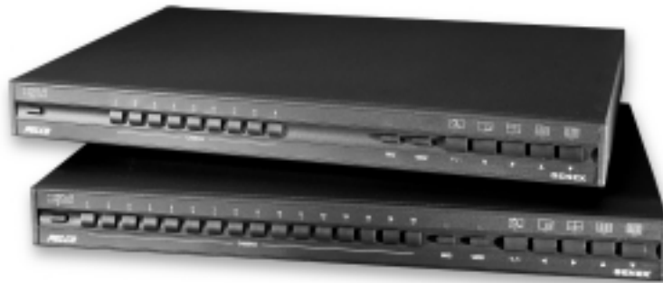
MX4009MS (TOP) MX4016MS (BOTTOM)

Genex is easy to use, offers intuitive push-button controls for operation and password-protected, on-screen menus for easy system setup.