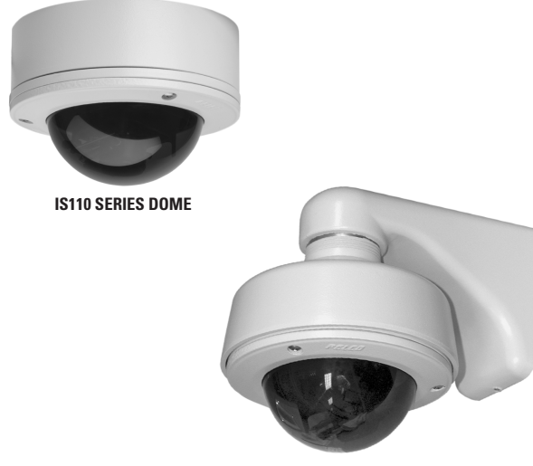
IS110 SERIES DOME WITH ICS110-PG PENDANT ADAPTER AND SWM-GY MOUNT