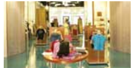
Affordable Solution for Retail and Small Businesses

Ensuring that users get the most from their system, Sarix IM Series Mini Domes feature the H.264 compression algorithm. H.264 delivers optimized image quality while minimizing bandwidth consumption on the network.