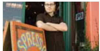
Quality and Connectivity for Every Budget