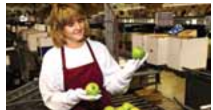
Advanced Technology for Any Environment