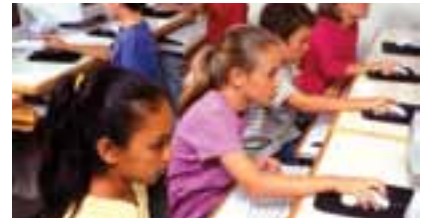
Ideal for School and Campus Settings