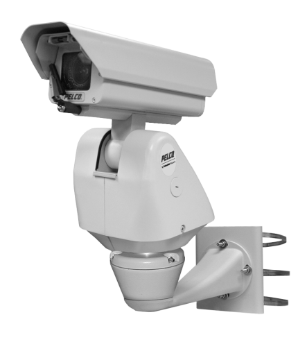
ESPRIT SE IOP SYSTEM WITH WIPER (SHOWN WITH WALL MOUNT AND POLE ADAPTER)

The ES40/ES41 Series variable pan and tilt speeds range from 0.1 to 40 degrees per second in manual pan mode, and 0.1 to 20 degrees per second in manual tilt. Pan preset and turbo speeds are 100 degrees per second in wind speeds of 80 kph (50 mph) and 50 degrees per second in the 145 kph (90 mph) wind-speed profile. Tilt preset speed is 30 degrees per second. The ES40/ES41 Series is capable of 360 degrees of continuous pan rotation. The tilt range allows for horizontal viewing of +36 to -85 degrees. There are 256 configurable preset positions with a preset accuracy of 0.1 degree.