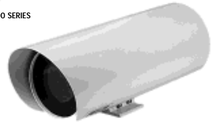
ENCLOSURE WITH SUN SHROUD

The enclosures of the EH2500 Series are dust-tight and waterproof to protect CCTV cameras from adverse environmental conditions.