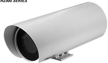
ENCLOSURE WITH SUN SHROUD

The enclosures of the EH2500 Series are rain- and dustproof to protect CCTV cameras from adverse environmental conditions.