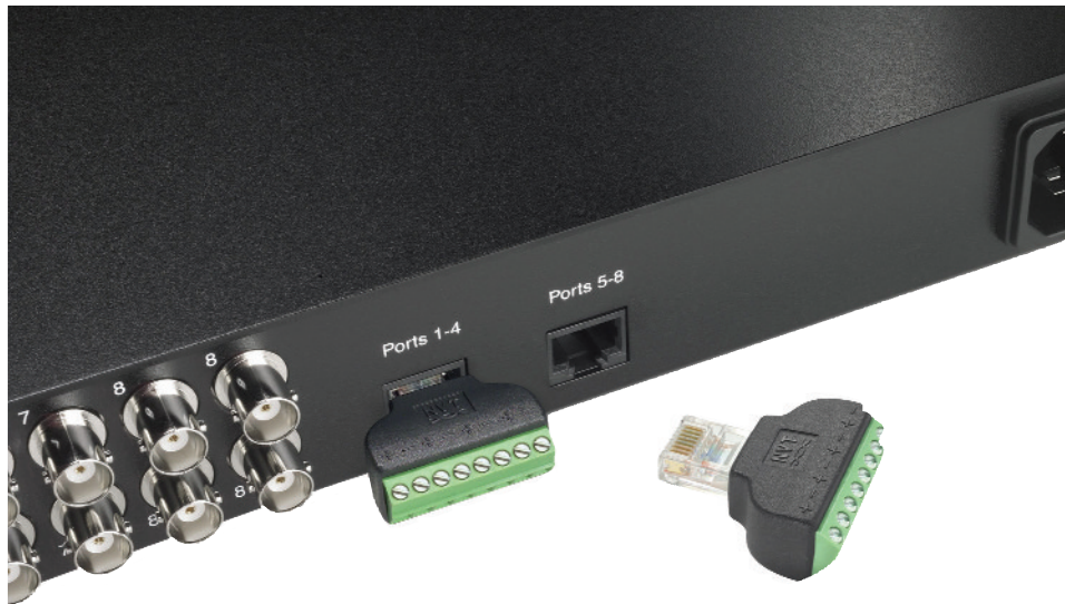
Screw terminal block channel pinout