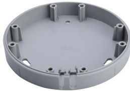
Plate with threaded screw holes for ceiling mounting