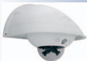
D12 with Outdoor Wall Mount IP65

* Only D12 with Outdoor Wall Mount has protection class IP65