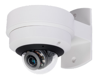
Shown with optional wall mount