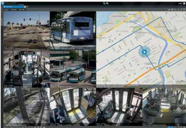
March Networks Command™ for Transit software user interface with map and GPS data overlay

March Networks' exceptional video compression and wireless data management technology enables significantly faster download times than most comparable systems. A one-hour clip from six cameras recorded at 4 fps, CIF resolution, for example, takes less than five minutes to download.