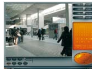
Easy to use "point & click" interface