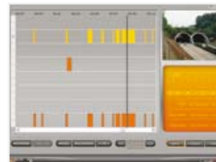
The search interface displays months of recorded video