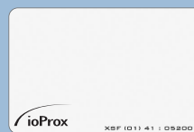
P20DYE Dye-Sub Card