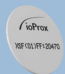
P50TAG Self-Adhesive Tag