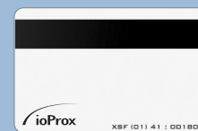
P30DMG Dye-Sub Card with Mag Stripe