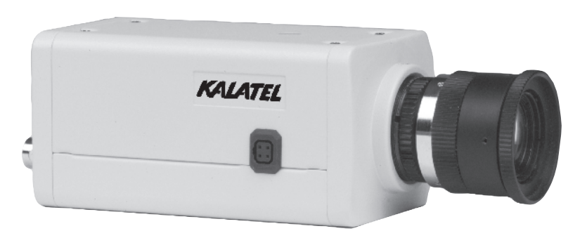
The KTC-215C lets you use C- and CS-mount lenses.

he KTC-215C is a high resolution general-purpose color security camera that offers 480 lines of resolution and high sensitivity (.05 lux). The KTC-215C lets you use C- and CS-mount lenses. The KTC-215C's automatic backlight compensation prevents important foreground objects from becoming silhouetted against bright backgrounds.