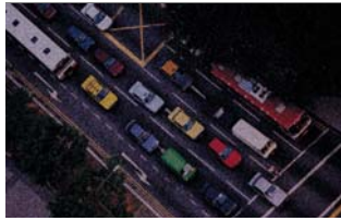
JVC Super LoLux™