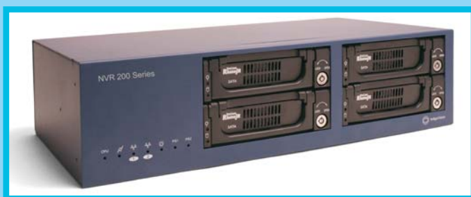
NVR RA1000 / RA1500 / RA2000 / RA3000 with RAID

The NVR 200 Series provides a powerful and integrated recording and playback system for video and audio from transmitters and receivers, with a choice of integrated or removable disks.