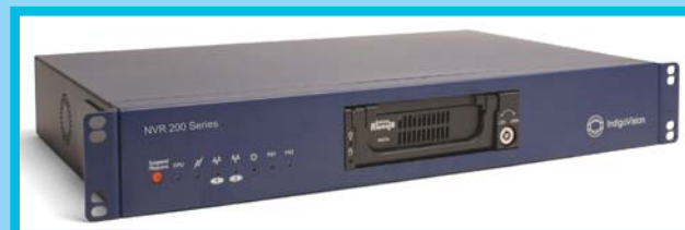
NVR RD250 / RD500 / RD750 with removable disk

Each NVR in a system can simultaneously record and play back pictures at full frame rate. NVRs are managed and configured by the Control Center application. Video can be played back to PCs, analog monitors and standard VCRs.