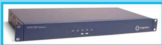
NVR FD500 / FD1000 / FD1500 with integrated disks

The Networked Video Recorder 200 Series is part of IndigoVision's complete IP Video product suite. This suite also includes a comprehensive range of transmitters and receivers and Control Center Enterprise IP Video and alarm management software.