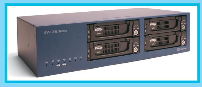
NVR RA1000 / RA1500 / RA2000 / RA3000 with RAID