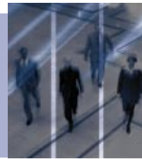
Setting New Standards in Entrance Control