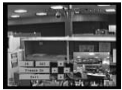
Upon selecting a camera image, a zoom screen will appear. An inset area allows you to select the portion of the image to zoom (up and down arrows), and the in/out buttons control the zoom factor. The HXCT4 provides an electronic zoom up to 32 times normal.