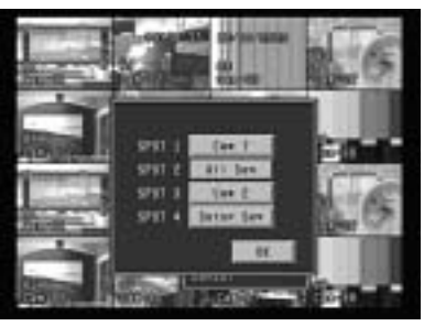
Right click the mouse and select functions such as live camera change, zoom, freeze mode or sequence type.