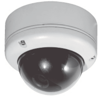
HD4CH shown with mount ring for surface mount