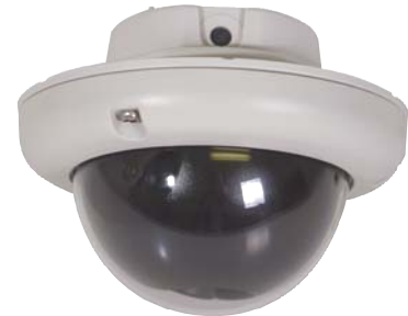
HD4CH shown without mount ring for flush mount