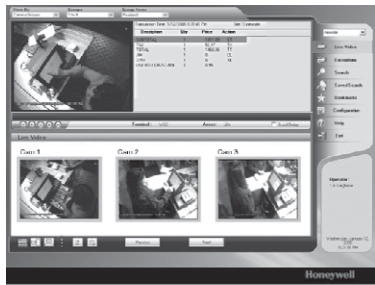
IDM User Interface