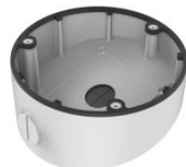
DS-1281ZJ-DM26 Inclined ceiling mount