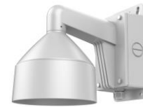
DS-1273ZJ-DM26-B Wall mount with junction box