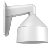
DS-1273ZJ-DM26 Wall mount