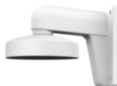
Indoor/Outdoor wall mount DS-1272ZJ-120