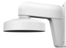
Wall mount DS-1272ZJ-110