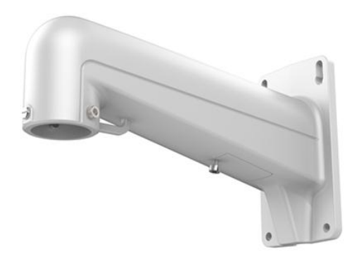
DS-1602ZJ Long-arm Wall Mount Bracket