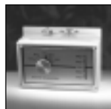
TH-350/PA Thermostat monochrome camera