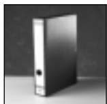
BF-350/PA Monochrome option