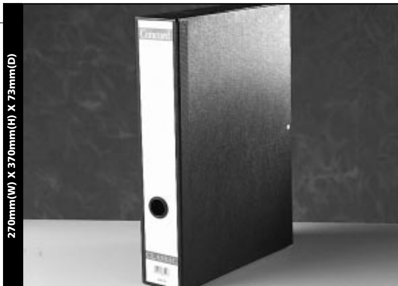
270mm(W) X 370mm(H) X 73mm(D)