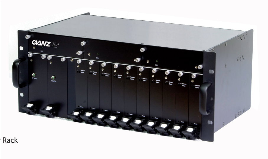
Front View Rack