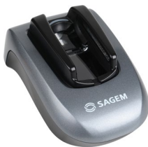
MSO FVP Finger Vein Enrollment Reader