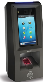
SIGMA Extreme Multi