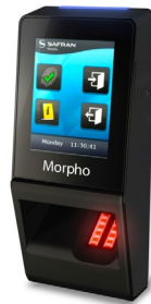
SIGMA Lite + Multi