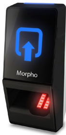
SIGMA Lite Multi

A wide range of IDEMIA products can integrate easily with the Gallagher solution, a selection of currently supported products are displayed below. For more detail, please contact your nearest Gallagher representative.