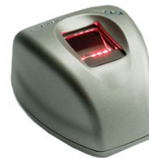
MSO 300 Enrollment Reader