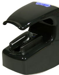
VP MD Finger Vein