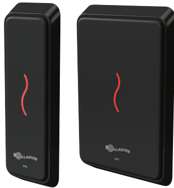
T Series PIV Readers