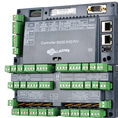
Controller 6000 High Spec - PIV