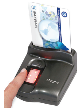
Morpho MSO 1350e