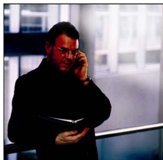
CCD colour camera