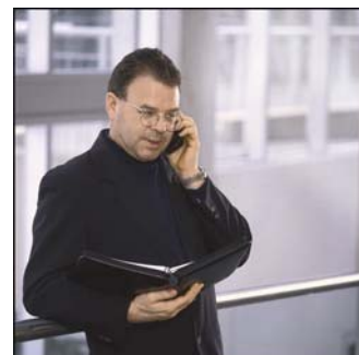
Wide Dynamic colour camera