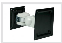
VMC-LCD/WMB-4 | SKU: 90468