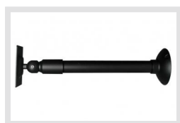
VMC-LCD/WCMB-1 | SKU: 90394