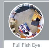
Full Fish Eye