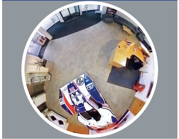
Example Full Fish Eye (ceiling mount)