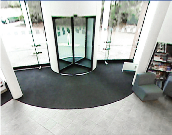
Example dewarped image (wall mount)