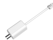
LR1002 ePoE Over Coax Converter